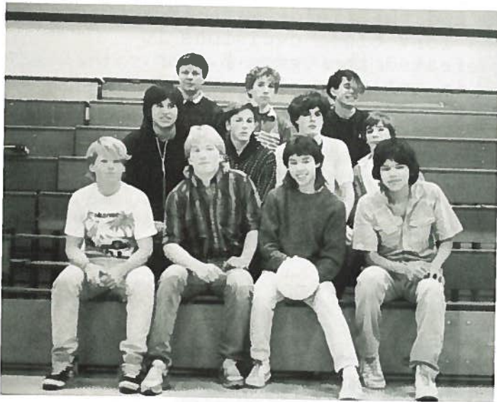
( L to R , TOP to BOTTOM )